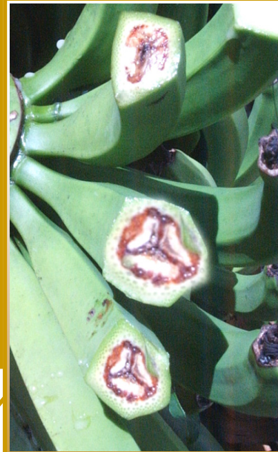
2 Fruit pulp blackens