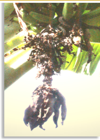
1 Rotting extends from the navel upwards.