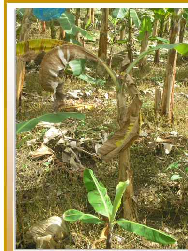
5 Young plants wilt, dry up and die.