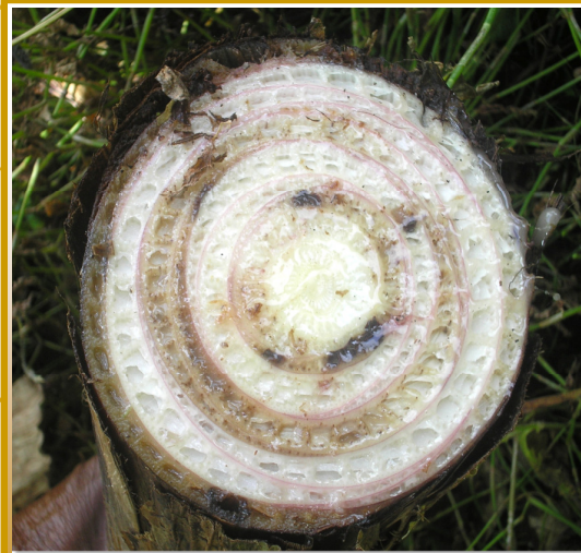
3 Internal tissue of cut stem shows yellowish brown discoloration